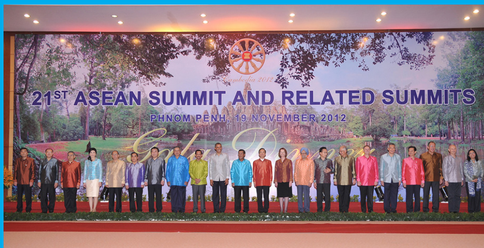
Photograph taken from the official flickr stream of Yingluck Shinawatra. Used under the creative commons license