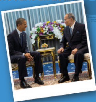
President Barack Obama meets with HM the King Bhumibol Adulyadej