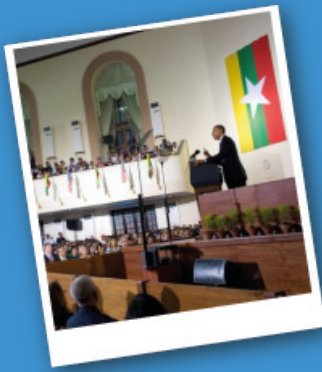
President Obama Delivers a Speech at the University of Yangon