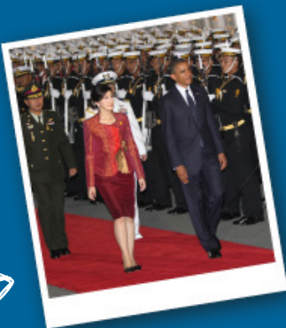
Prime Minister Yingluck and President Obama reviewing honor guard in Bangkok.