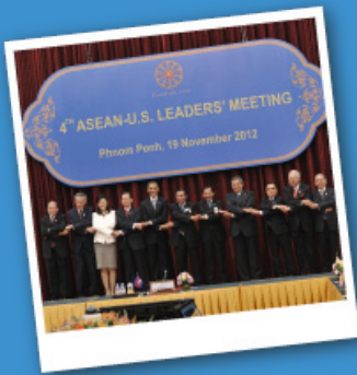
Leaders of ASEAN countries and the United States pose for a photo